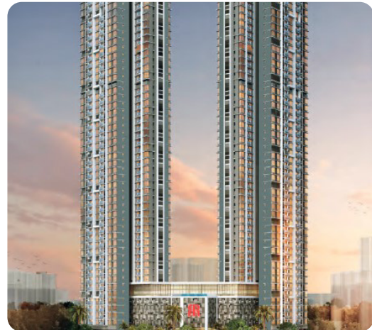
Raymond The Address by GS-1 2 Towers, 62 floors | Residential Project Electrical Work