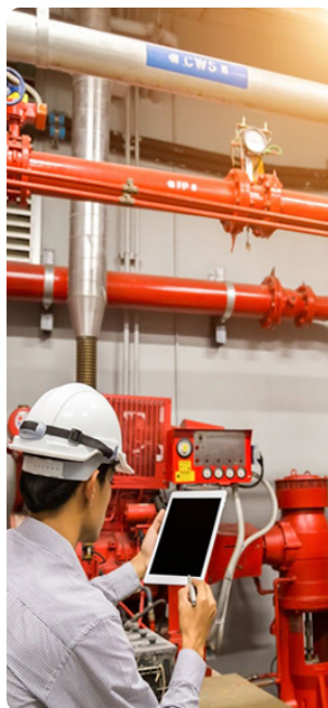
Firefighting & Fire Alarm Installation Systems