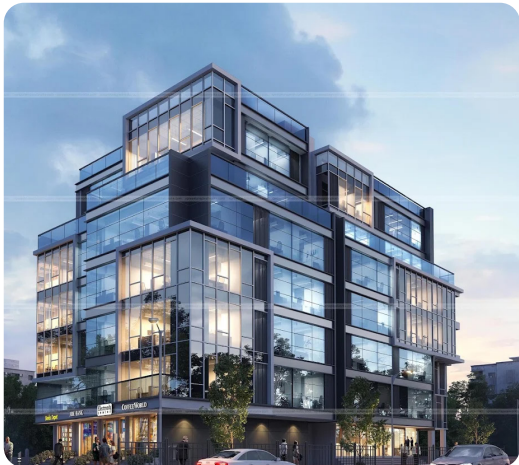
Mahant Chamber, Thane 6 floors | Commercial Project Electrical & Firefighting Work