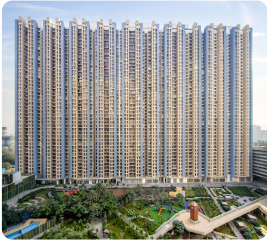
TenX Habitate ,Raymond Realty, Thane 10 Towers, 42 floors | Residential Project Electrical Work