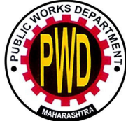
Public Works Department