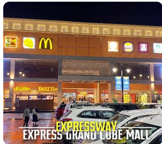
Grand Plaza Food mall Khalapur Foodmall Electrical & Firefighting Work