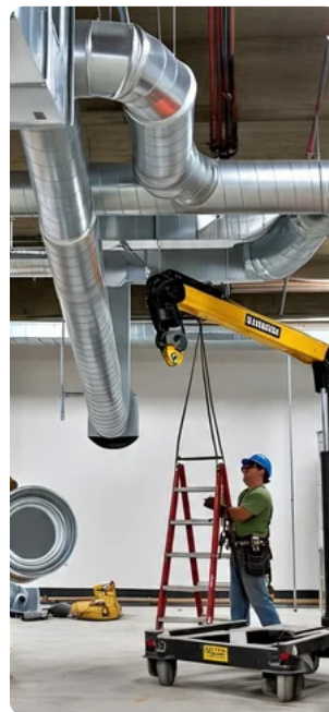
Hvac Installation & Ducting Systems