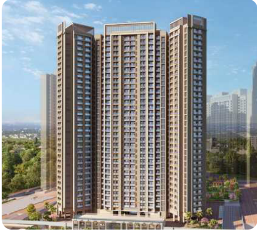
Dosti West County Project, Thane 8 Towers, 30 Floors | Residential Project Firefighting Work