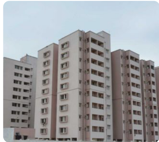
BG Shirke Project at Virar Commercial Project Firefighting Work