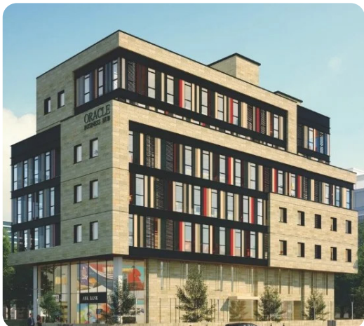
Oracle Business Hub, Thane 6 floors | Commercial Project Electrical Work