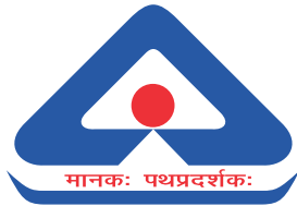
Bureau of Indian Standards (BIS) Compliance & Approvals

With a strong focus on industry standards and best practices, we ensure every project meets the required approvals, delivering reliable and compliant solutions across residential, commercial, and industrial developments.