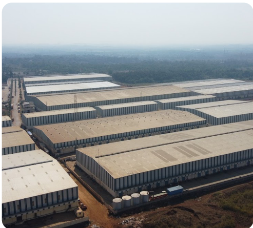
Antariksha Logipark, Dohale, Bhiwandi Warehouse Firefighting Work