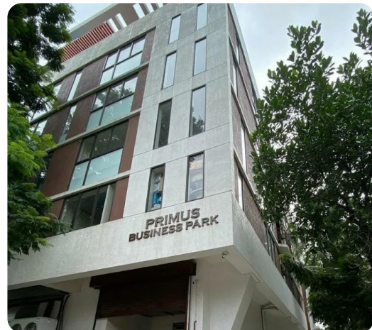
Primus IT Park, Thane 6 floors | Commercial Project Electrical & Firefighting Work