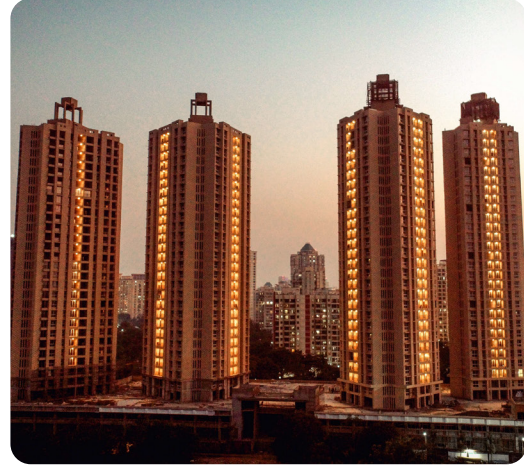
Vijay Sureksha Orovia Project 25 floor, 3 towers | Residential Project Firefighting Work