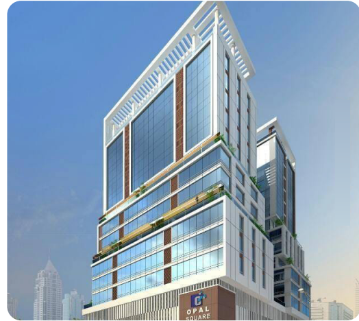
Opal Square IT Park, Thane 20 floors | Commercial Project Electrical Work